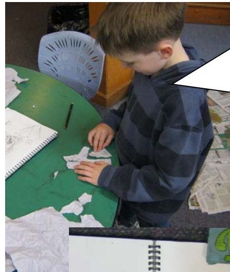
We have been drawing symbols based on the artist John Pule who did it on Tapa cloth. We are creating a modern version of a Tapa cloth.