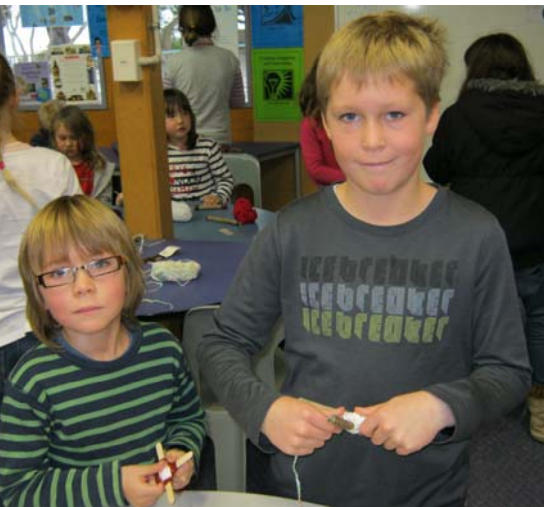
Matariki activities on Thursday. The students enjoyed working with different age groups, and in some cases, their siblings!