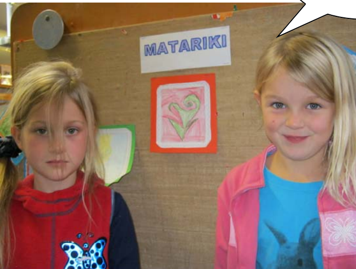
We designed our own fishhooks for Matariki!