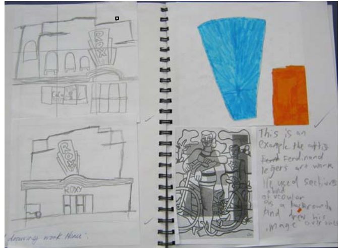
We are doing art based on Leger. We are making our own version of it about this area. We put a grid over a photo to make it easier to copy and we have to add shapes and colours in the background and then the picture in the front. We can only use hot colours and 1 cold.

Creating masterpieces for the Art Exhibition is well underway. Children have been learning to scale images, understand the meaning behind Tapa cloths and continue developing their observational skills.