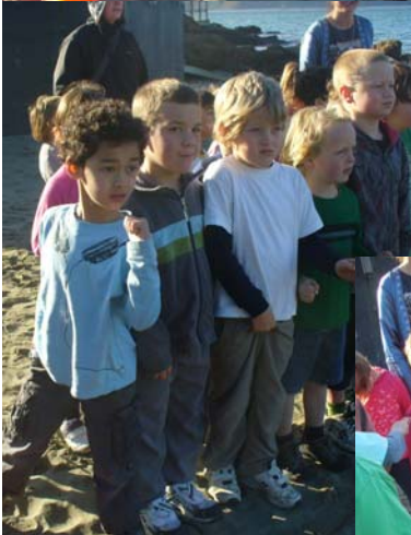
Worser Bay School Cross-country 2011