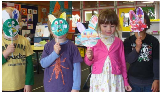
The finished puppets! Guess who is behind which puppet!