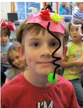
The students recently made Fascinators for the School Disco.