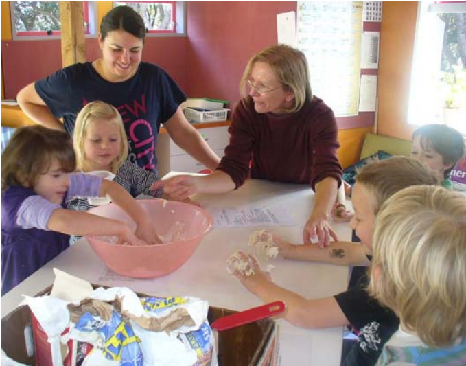
Baking Takakau Bread