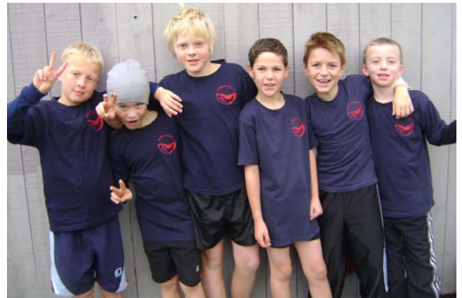
Some happy cross-country competitors!