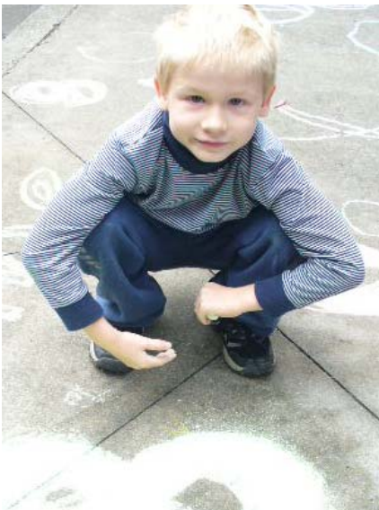
Chalk Writing in Autahi