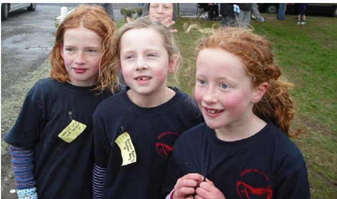
Eastern Zones Cross-Country held at last!! Some excited participants!