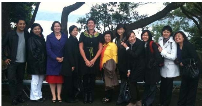
Our colleagues from Singapore enjoyed their visit.