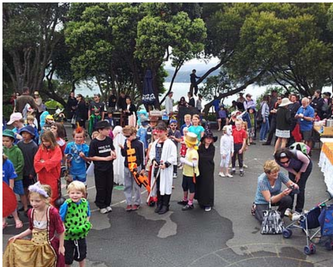
Everyone had a wonderful time at our Fair last Sunday!