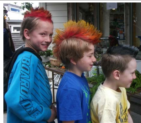
Helpers, staff and students enjoying the fair!