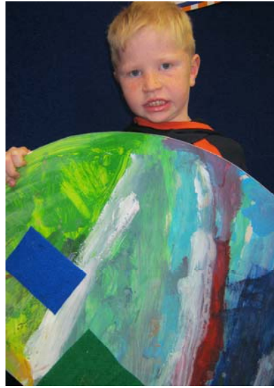
I am proud of my art because I like the texture and colour.

A note from Tautoru-iti: Please could parents let us know if they are willing to take 20 bottles to add to their recycling for when the day comes that we say goodbye to our igloo!