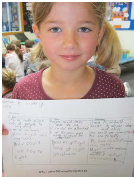
This shows I am learning to use a PMI chart to organise my ideas after reading.