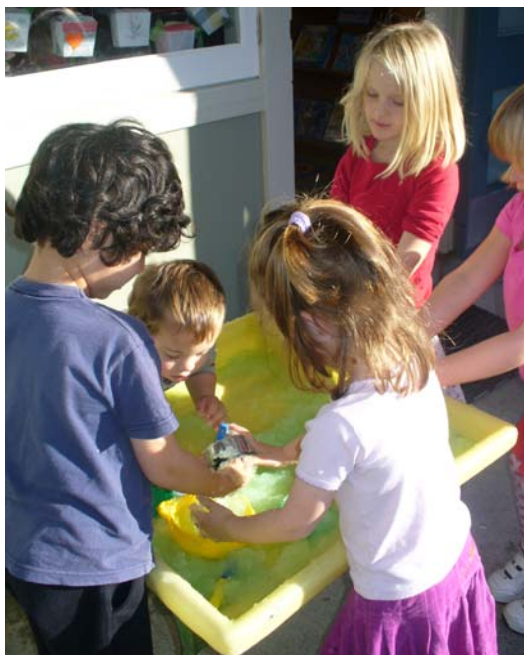
Tautoru-iti have fun with their green 'goo'!