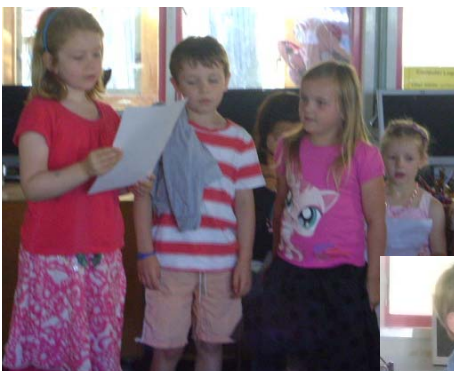
This Morning's Assembly