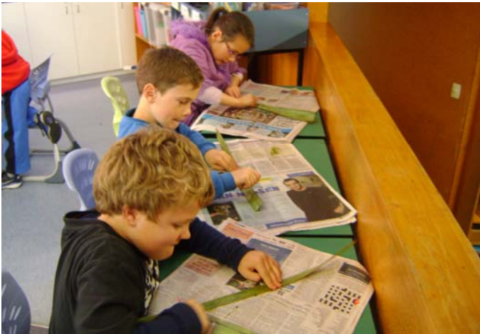
Scraping flax to get fibres for rope weaving