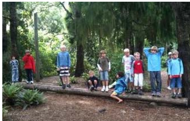
An exciting day at Camp 2011! Lots of great photos on page 2.