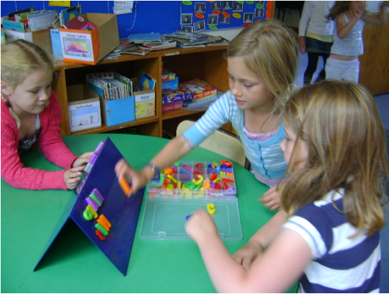
Above - using magnetic letters, Below - maths activities