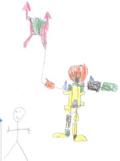
I like to play with my ultimate ferno with a slashing sword.