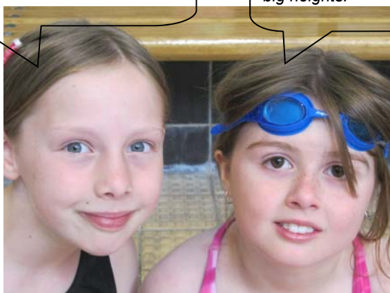
Māhutonga students are loving their swimming!

I'm learning to be more brave when diving off big heights.