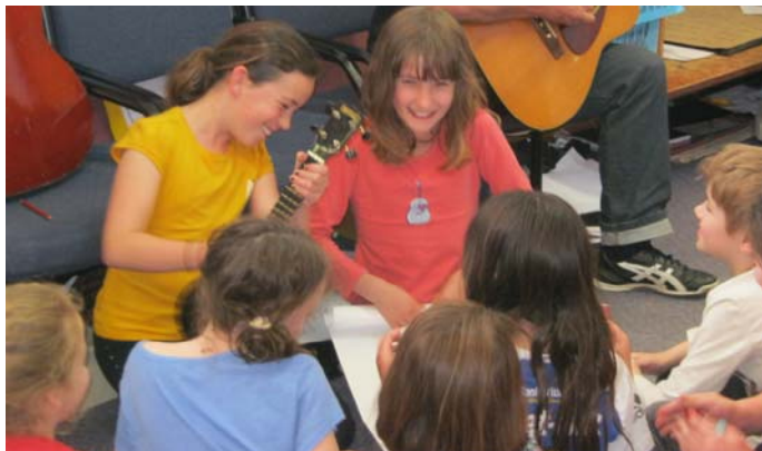
Māhutonga students sharing their compositions

I'm learning to keep my body straight when diving like a pin.