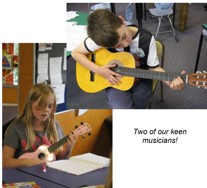
Two of our keen musicians!