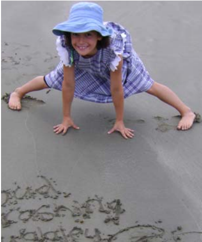
Māhutonga have fun with their beach writing. See page 4.