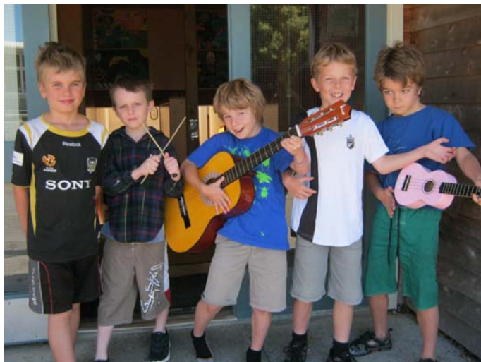
Crash and Dr Wam - two of Māhutonga's bands ready for their busking!