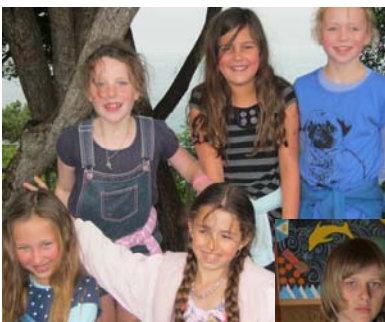
Bad Swans and Super Epicness

We are getting ready to take our music out to Wellington. On Tuesday we are off to Clyde Quay School. Please note the change of date as we have swimming on Thursday. Please see the permission form on the back page. No slip, no trip.