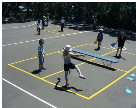
Students enjoying a game of pater tennis on the newly marked courts.