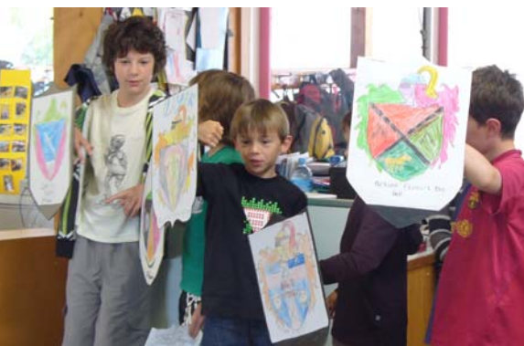
Hot off the press! Assembly this morning...

Please complete the slip on page 4 and return to the office by Friday 27 th Nov.