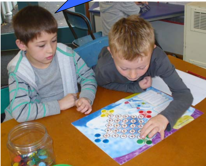
Mathematical thinking and learning. See more on page 2.

We are practising our adding basic facts by playing Diamond Dazzle