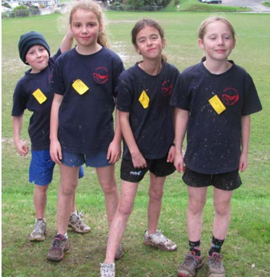
Our Worser Bay Runners at the Inter-Zones on Tuesday.

We are practising our adding basic facts by playing Diamond Dazzle