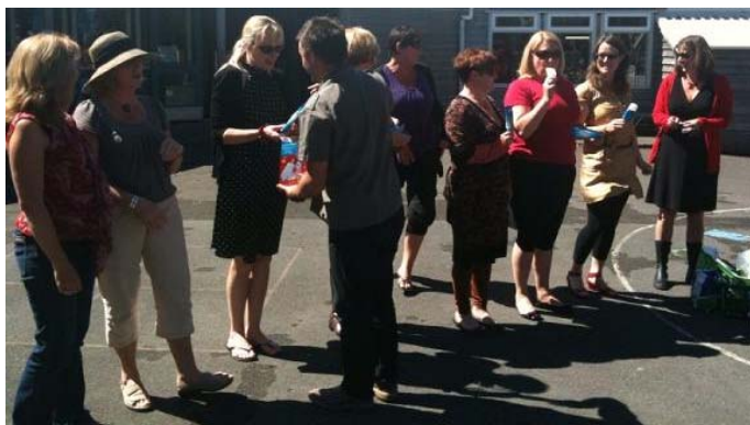
The Sports Prizegiving yesterday was a great success!