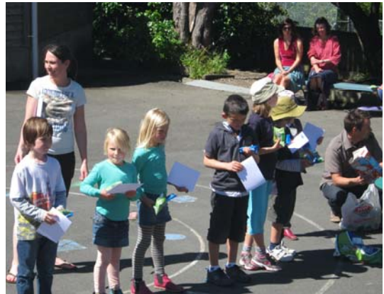
More happy sports people at the Sports Prizegiving...