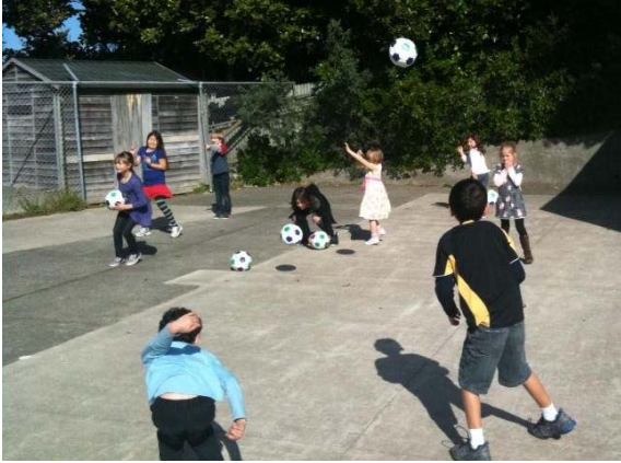
Our Pupil Activity Leaders (PALs) are enjoying the great weather and doing a fab job.

"You can teach a student a lesson for a day; but if you can teach them to learn by creating curiosity, they will continue the learning process as long as they live." ~ Clay P. Bedford