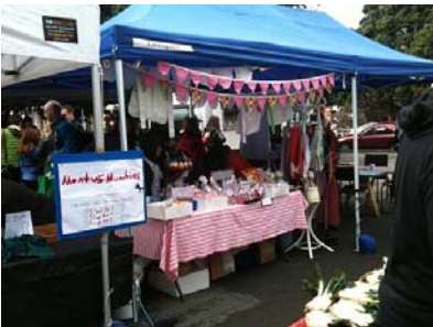
Our award-winning stall at the Hill Street Market

Don't forget to get your Raffle tickets! The Home and School account is 06 0513 0304691 00 (Ref: Raffle) . Your envelope is due back by the end of Monday.