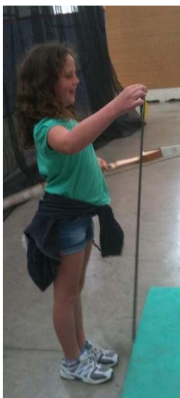
Archery at camp.