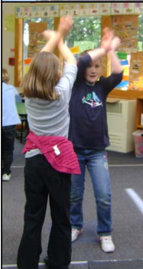
It's all go for 'Ebb and Flow'!