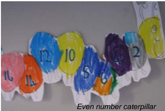
Even number caterpillar

We have been learning about odd and even numbers and trying to skip count starting from one, or starting from two.