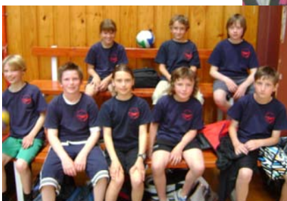
Left - The Year 6 team played well together and made it into the quarter finals.

The year 4/5 team won the Fair Play Award at the Eastern Zones' Miniball tournament on Wednesday. It is fantastic to be recognized by other parents, teachers and coaches for such great team work. Well done!