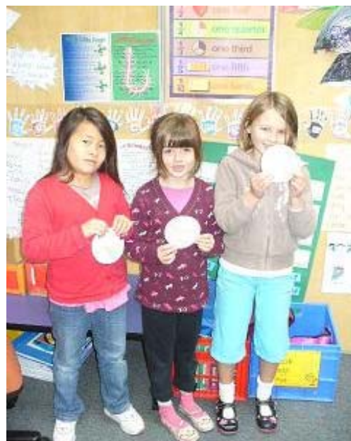
Three of our Tautoru students with their pizza circles. (See page 3)

The Principal's Awards for next week are for being respectful and behaving appropriately in public and for excellence in the Arts.