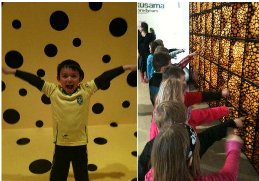
The trip to Yayoi Kusama's exhibition last week was thoroughly enjoyed by the whole school.

Some photos were taken by City Gallery staff which may be used for City Gallery publications. If any parents have concerns regarding this, please let us know by next Friday.