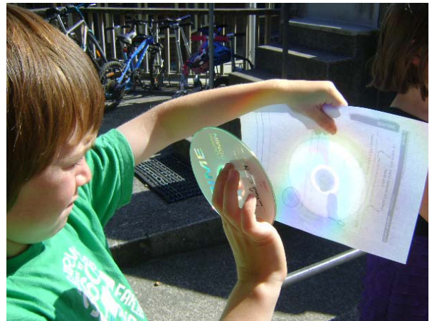
We are learning to look closely and observe.