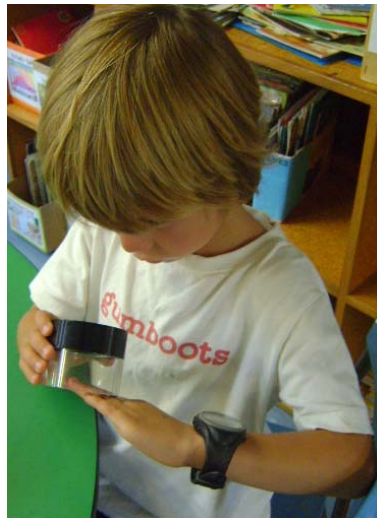
"I can see little 'in' lines. I don't know what they are called."