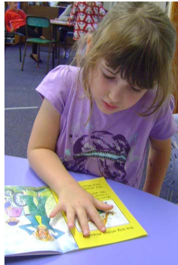
Focus on reading.