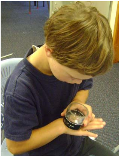
"I noticed I had hair all over my hand."