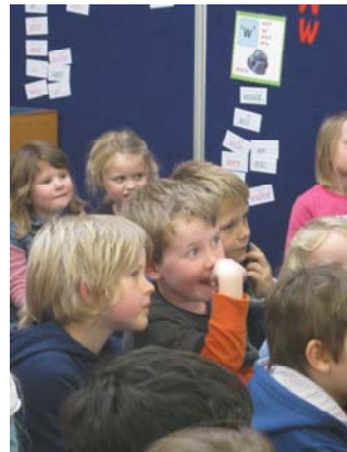
What could be inside that box?

Creative thinking is not a talent, it is a skill that can be learnt. It empowers people by adding strength to their natural abilities which improves teamwork, productivity and where appropriate profits.