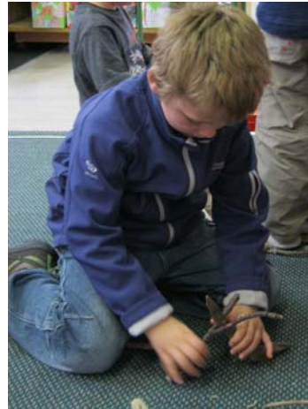
Building a house of sticks...

Some very original and unique ideas surfaced during our discussions: