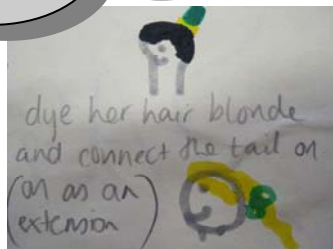
Clip it on like a hair extension... Make it into a necklace... Make it into a worry doll...