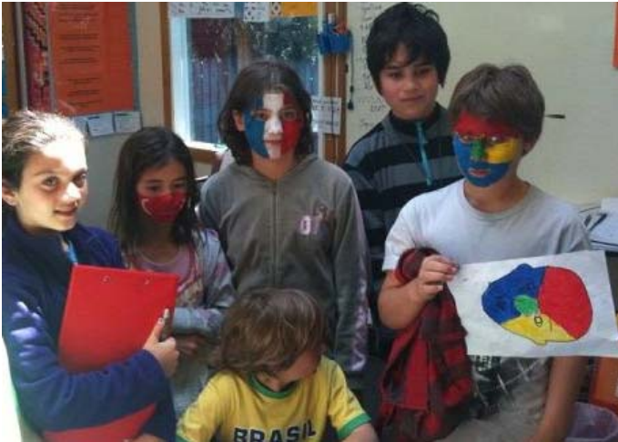
Māhutonga organising, testing and choosing their favourite face paint for the fair by doing a statistical survey!!