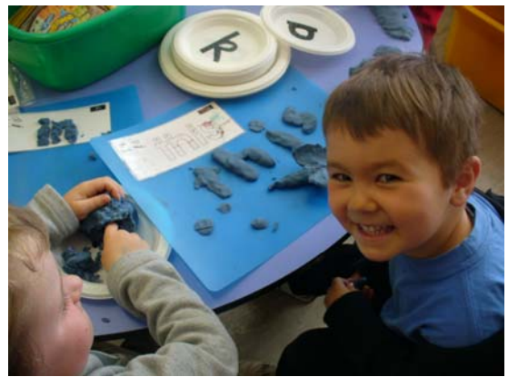
Tauroru Iti have been spelling the words we know.