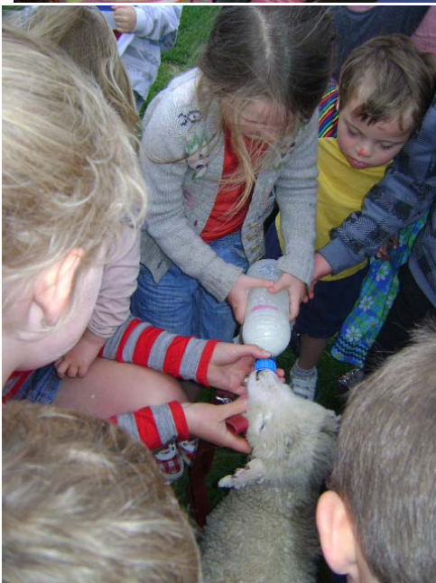
Tauroru have had lots of experiences this week! (See more inside!)