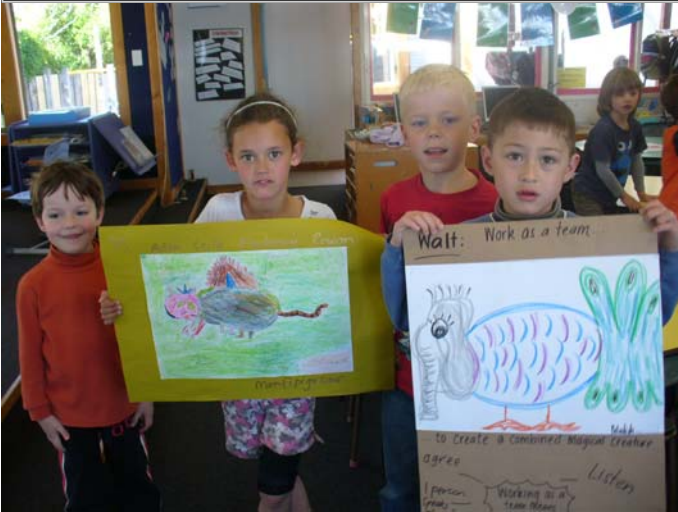
Tauroru have been working in teams to create a combined magical creature. Finished at last!