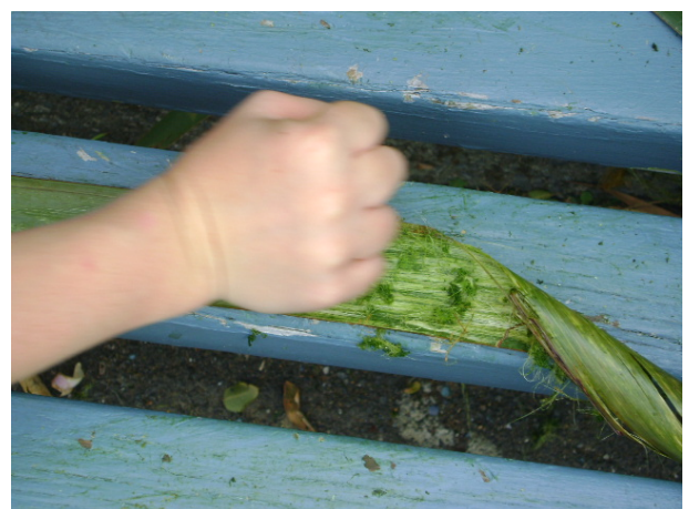
The rope makers!