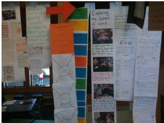
The Music Inquiry is full steam ahead!